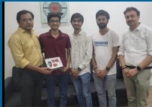
Myosa Kit (Worth $500) granted to our students

IEEE SCET Student Branch Sarvajanik College of Engineering & Technology, Surat Website: scet.ac.in LinkedIn: IEEE SCET SB