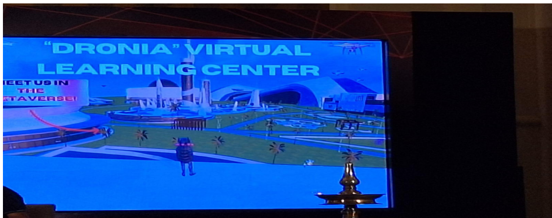
Photograph of Virtual Drone Learning centre by Drone-IT, Australia