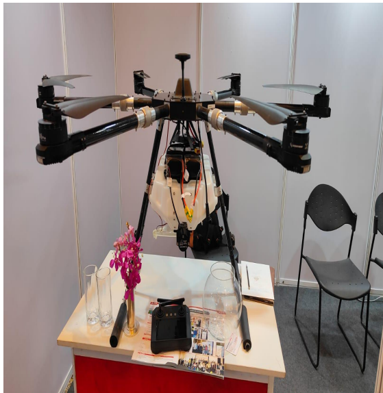
Agro- drone with 10 litre capacity of pesticide