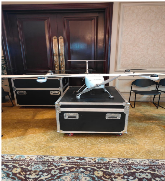
Surveillance Military drone