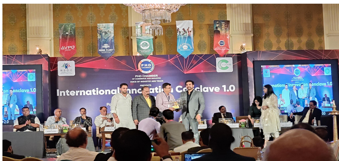
Received Memento from Mr. Arbaz Khan - Brand ambassador of AVPL