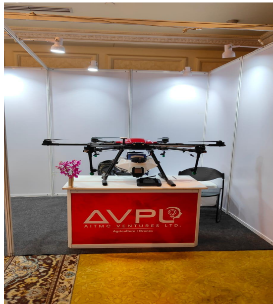
Drone for sprinkling pesticide and seeds