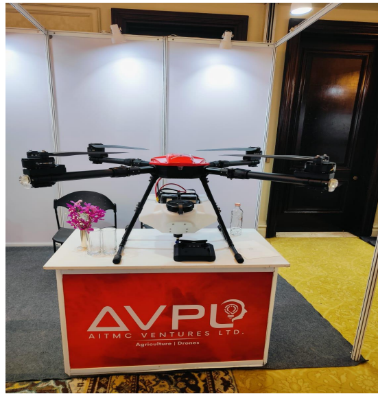
Agro- drone with 16 litre capacity of pesticide