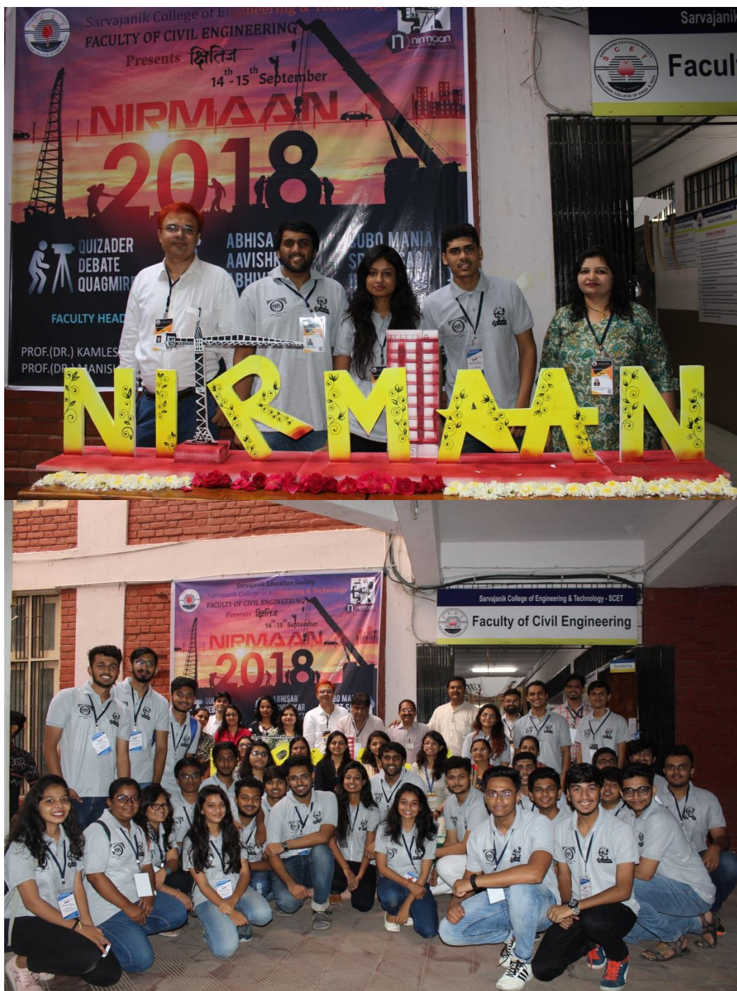
Team Nirmaan 2K18