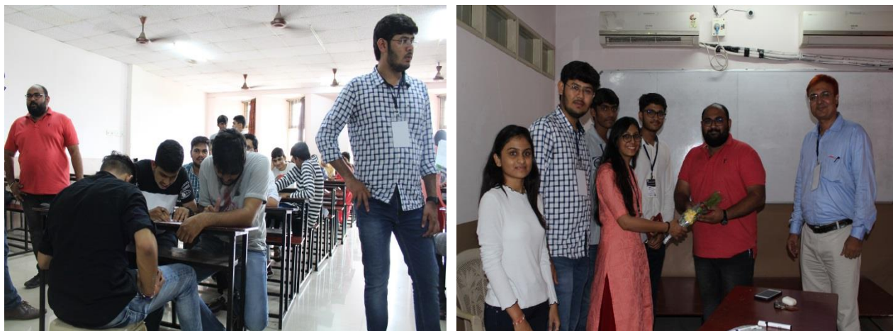
Glimpses of event