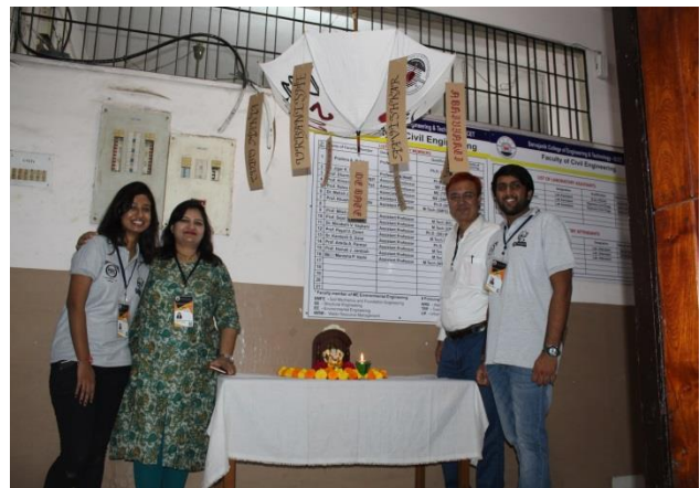
Inaugural Function and prayer of Shreeji