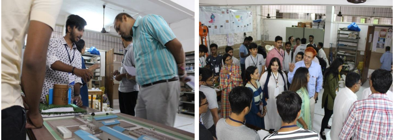
Glimpses of event