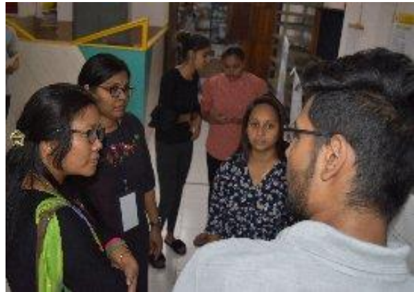
Glimpses of event