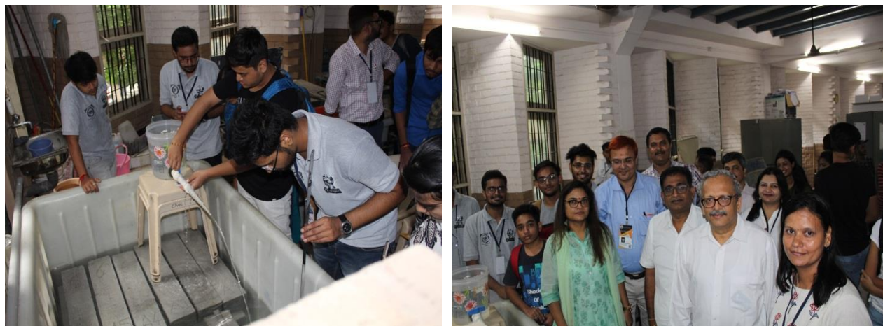
Glimpses of event

The winner team had maximum horizontal distance of jet through orifice in a single attempt using plastic sheets. Plastic sheet and adhesive were given to the students. Total 78 Team and 156 students participated with highest no of entry in Nirmaan 2K18.