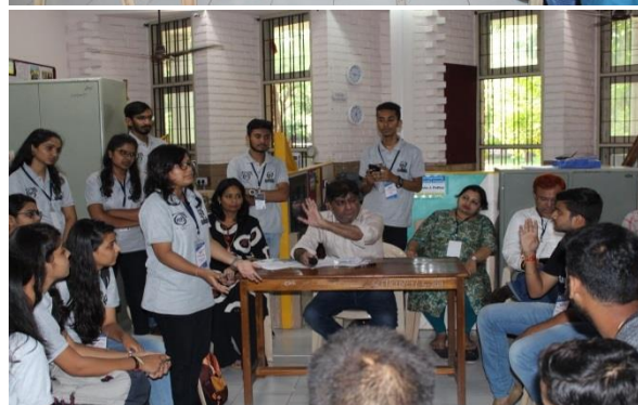
Glimpses of event