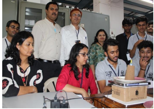
Glimpses of event