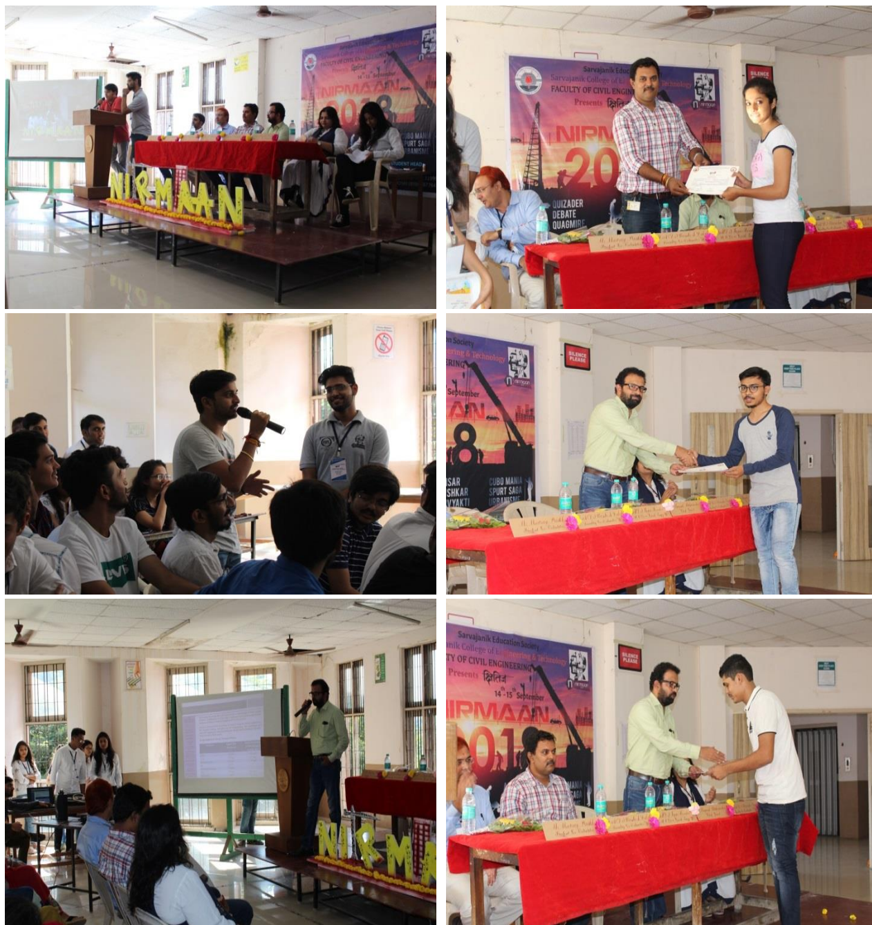
Glimpses of Valedictory Function

founder of Green Design & Engineering Services Pvt. Ltd. He delivered expert talk on principles and criteria on design of STP. After guest lecture, prizes distributed to winners of all events by the chief guest and head of department collectively. Nirmaan 2K18 were concluded by National anthem.