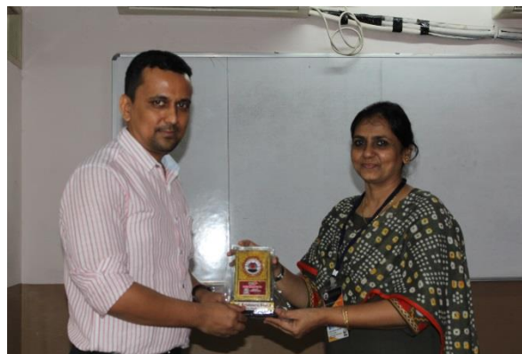
Glimpses of event