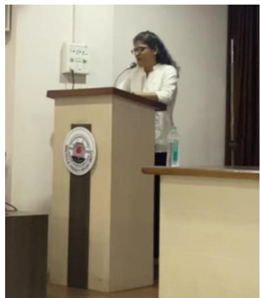
Feedback shared by Chair of IEEE SCET SB(L) and IETE SCET Student Forum(R)