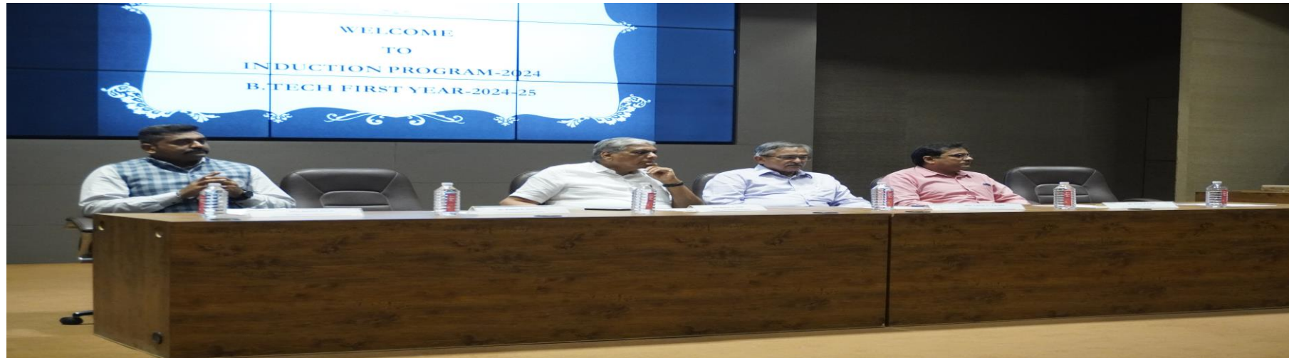
Dignitaries of University for welcome address