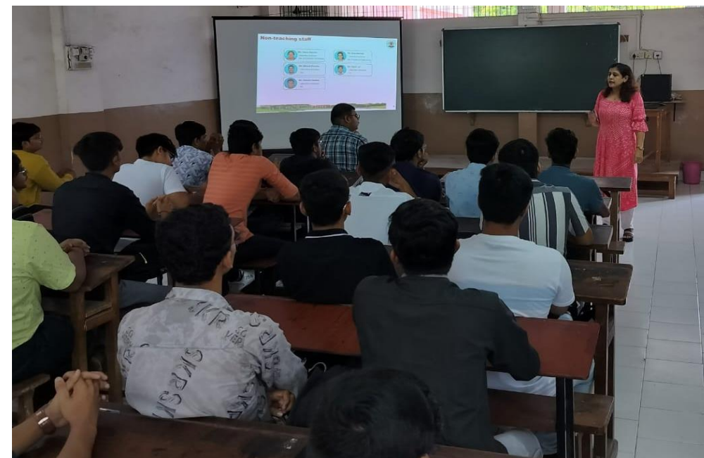
Welcome address by mentors, HOD's & Staff