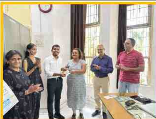
2 nd winner