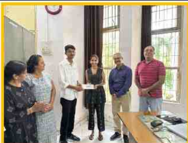
3 rd winner