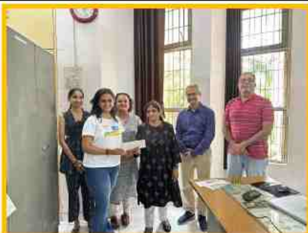
1 st winner