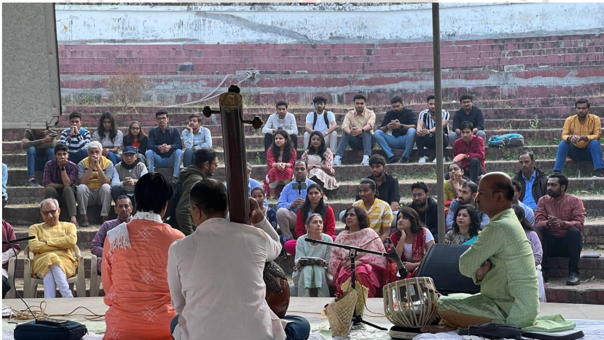
The presentation and the spellbound audience