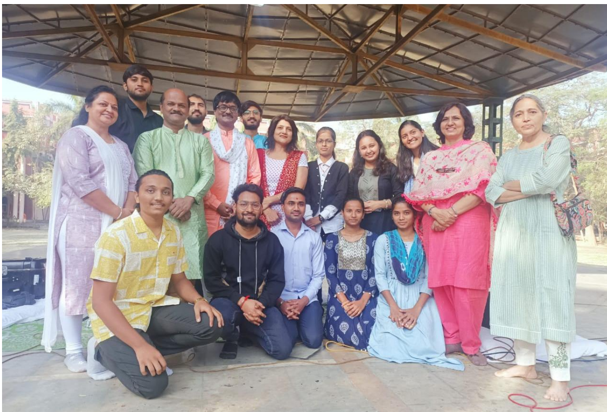
Group picture with students and faculty members after interactive session