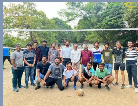
Runners Up 4 th Civil Dept