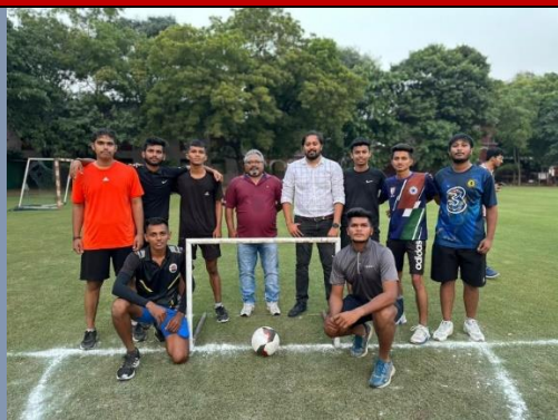
Champion 4 th I.C Dept