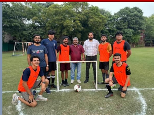
Runners Up 4 th C.O Dept