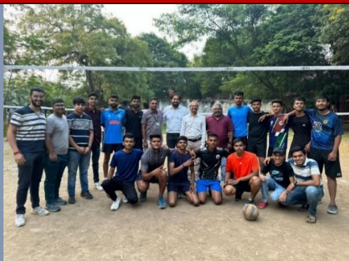
Champion 4 th I.C Dept