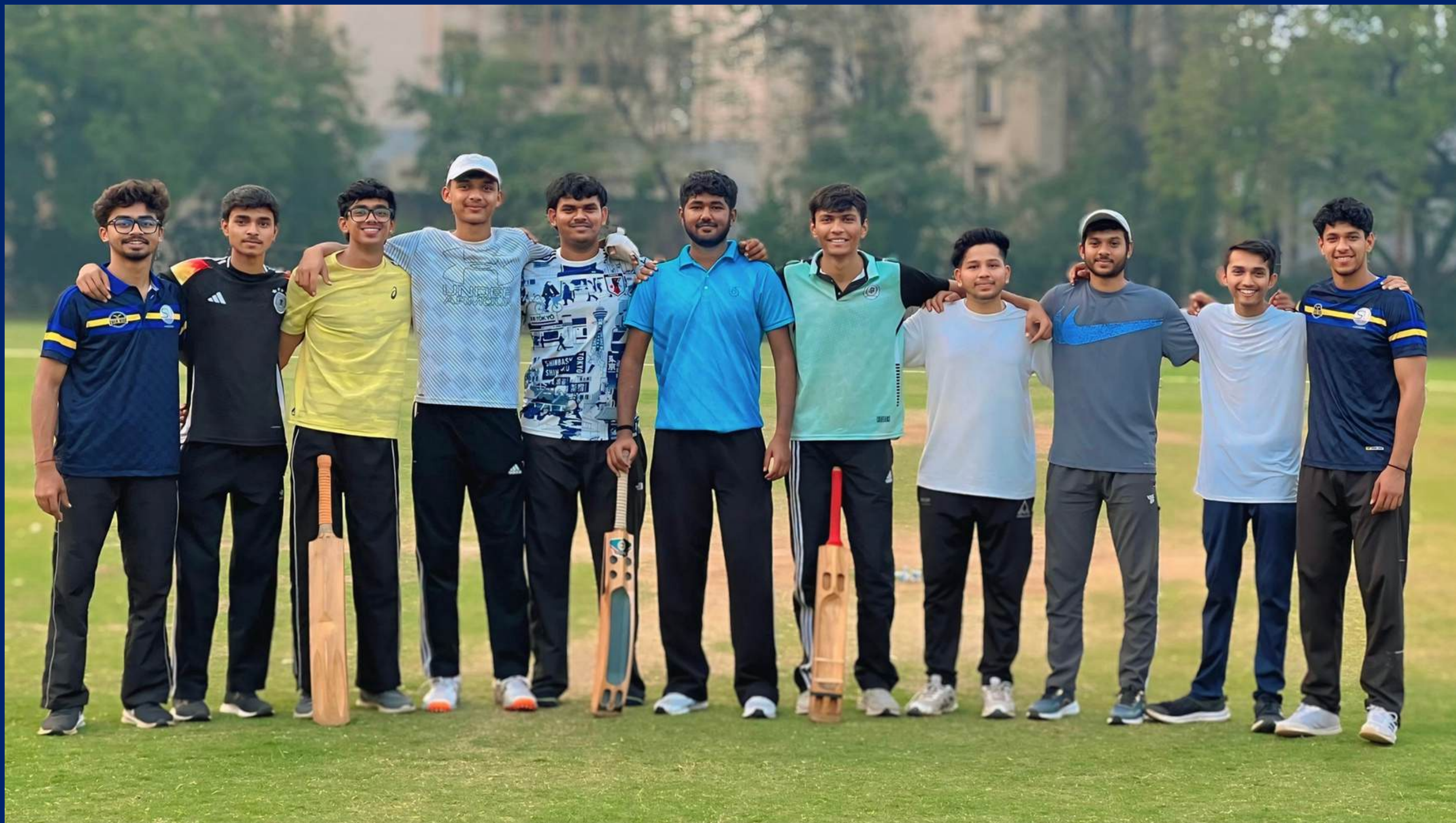
TEAM ONE SIDE