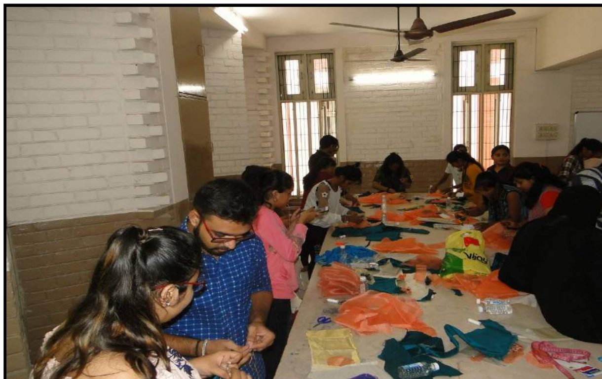
Participants preparing garments during Vastram