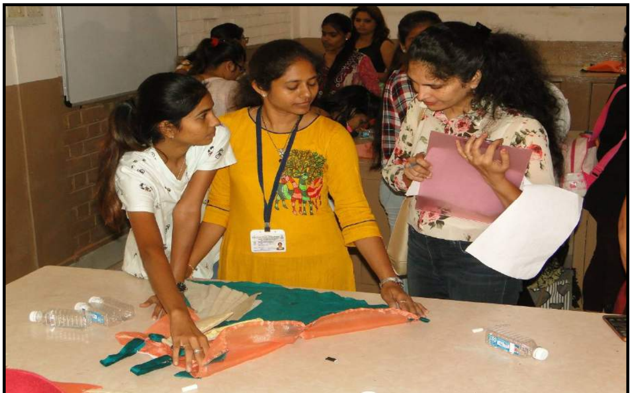
Jury evaluating garments prepared by participants during Vastram