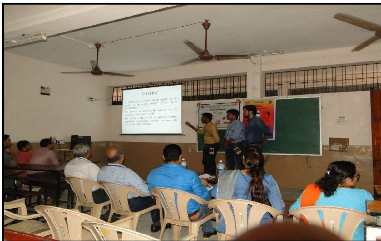
Participants presenting their paper during Abhivyakti