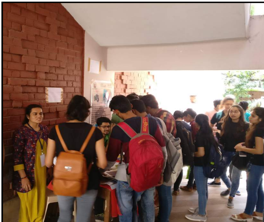
Participants' rush during event TexSnap