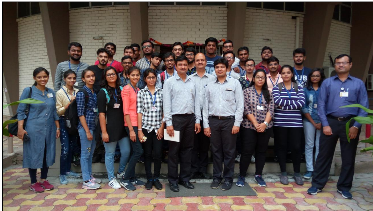
Figure 3 : Glimpse of visit

We are very grateful to ALDC, GETCO for giving permission for this visit. Students got an opportunity to know regarding practical aspects about what they are learning in theory. We hope that such kind of permission will be given in future also. It was an informative, interesting and a successful visit. Some glimpse of visit is shown in form of picture in Fig. 3.