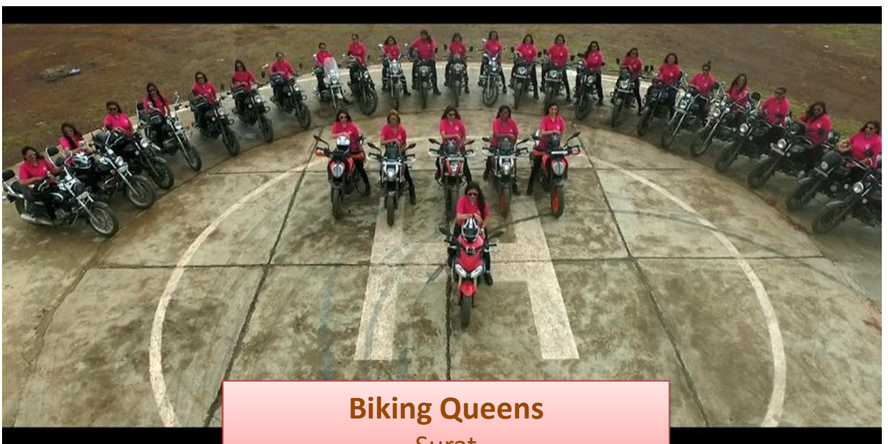
Biking Queens Surat