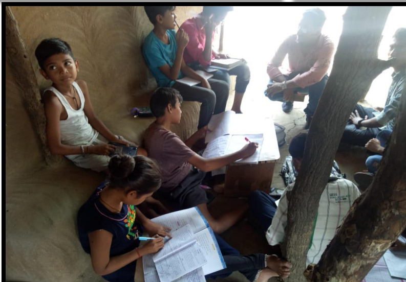
Some photographs taken on day 1