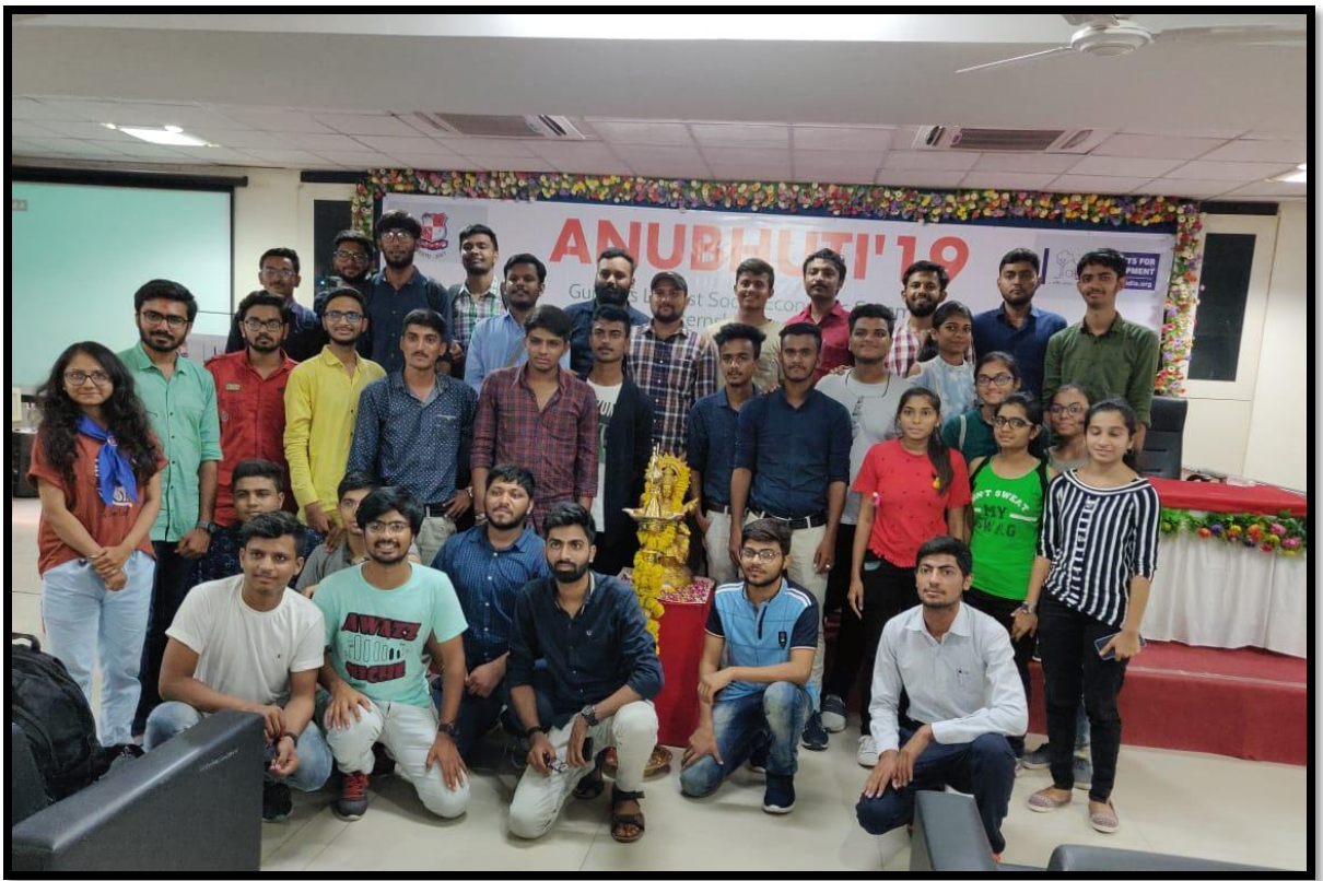
Photograph taken on day 3