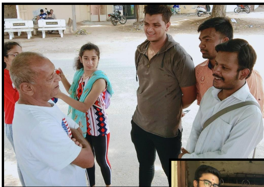
Some photographs taken on day 2