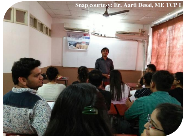
Er. Hiren discussing