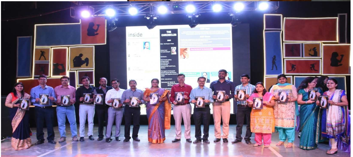
Launching of SCET Magazine "THE CHRONICLES"