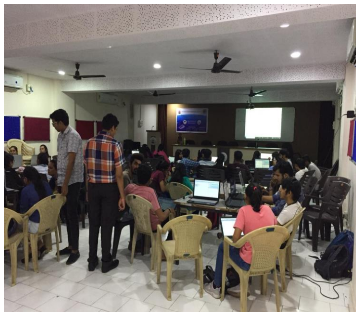
First session with hands on experience of Python programming