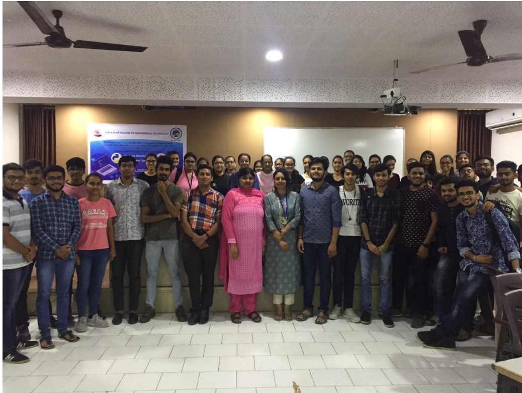
ISTE and Non ISTE Student Participants with speaker and coordinators