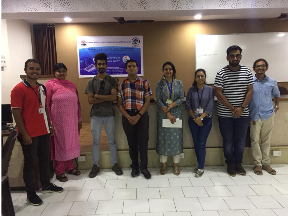
ISTE student volunteer team with workshop coordinators