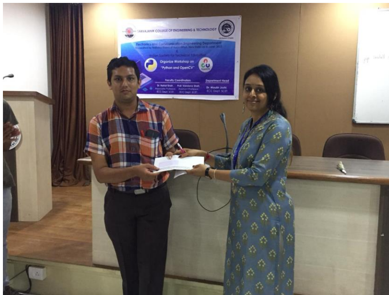
Thanks letter and Memento to the speaker