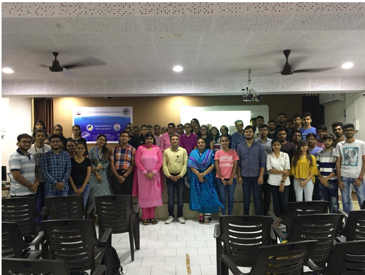
Group of ISTE student participants with workshop coordinators and ISTE representatives