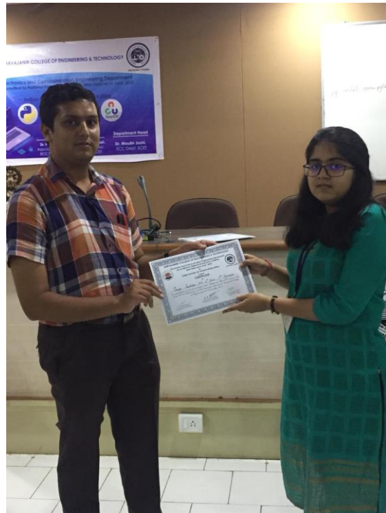
Certificates to the participants