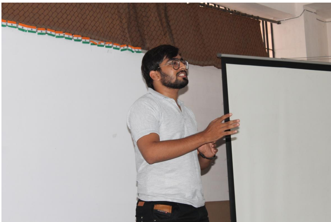
A participant performing in Melodrama