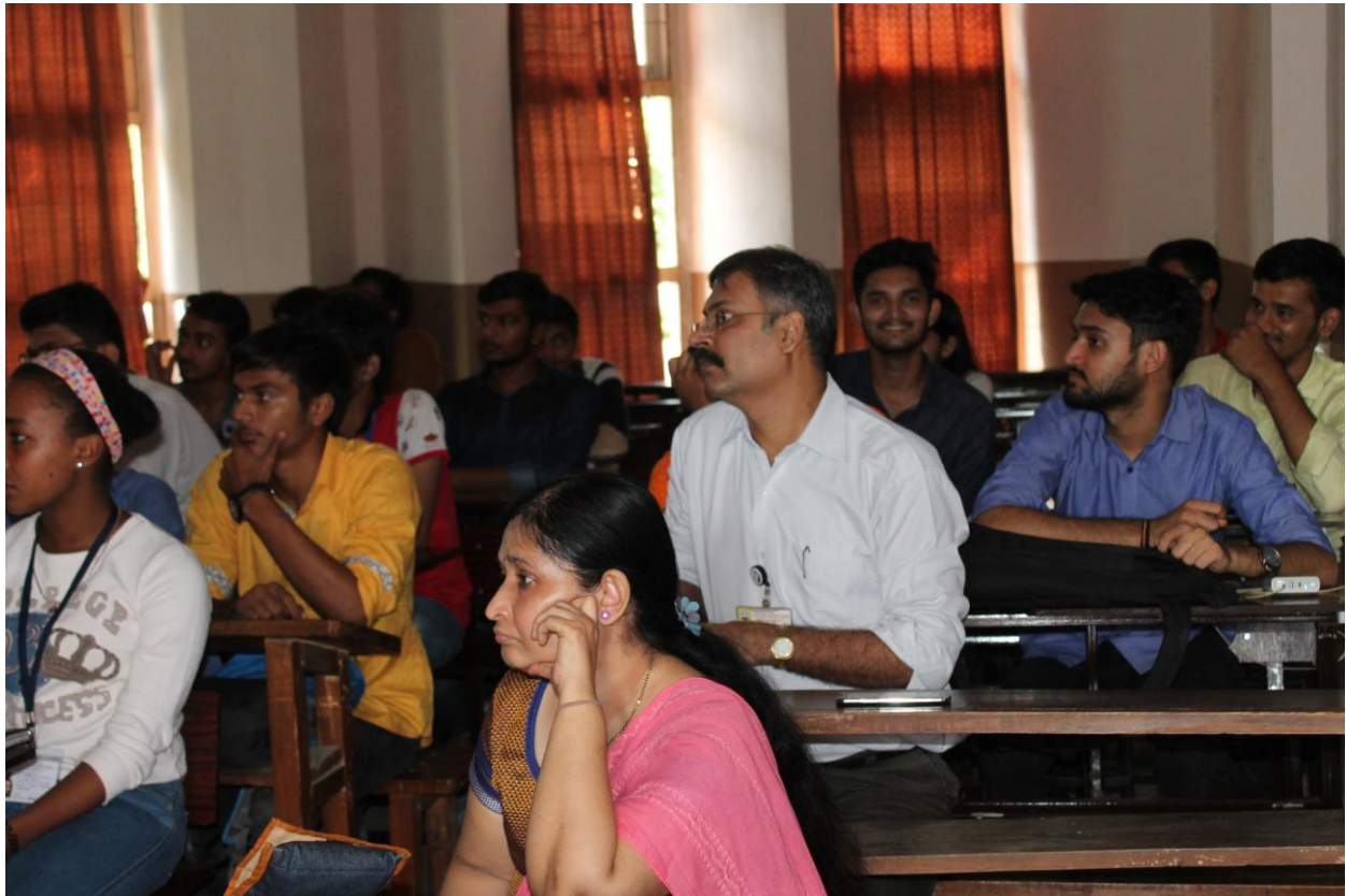
Student and Faculty gathering in Paper Presentation event