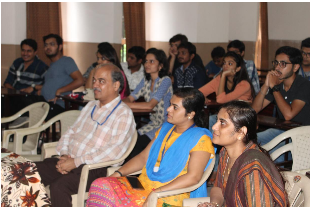
Students and faculty gathering for Melodrama event