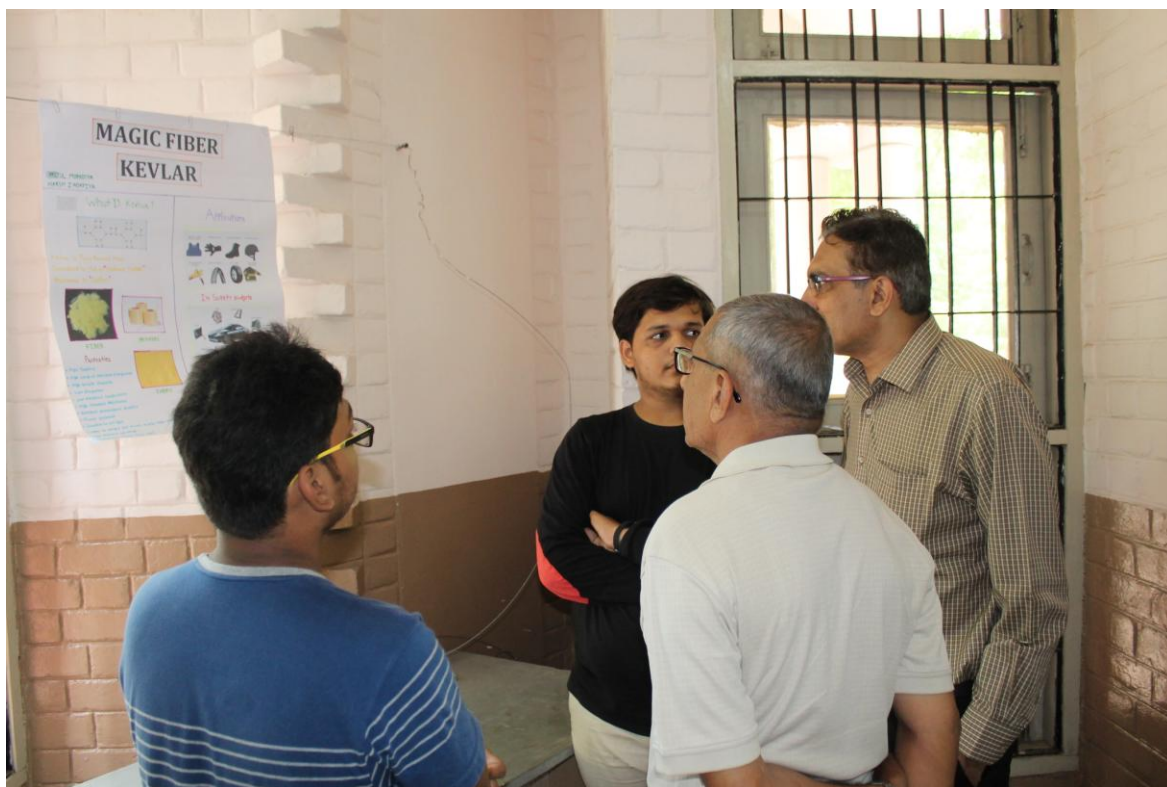
Visit of staff members from other departments for Poster Presentation