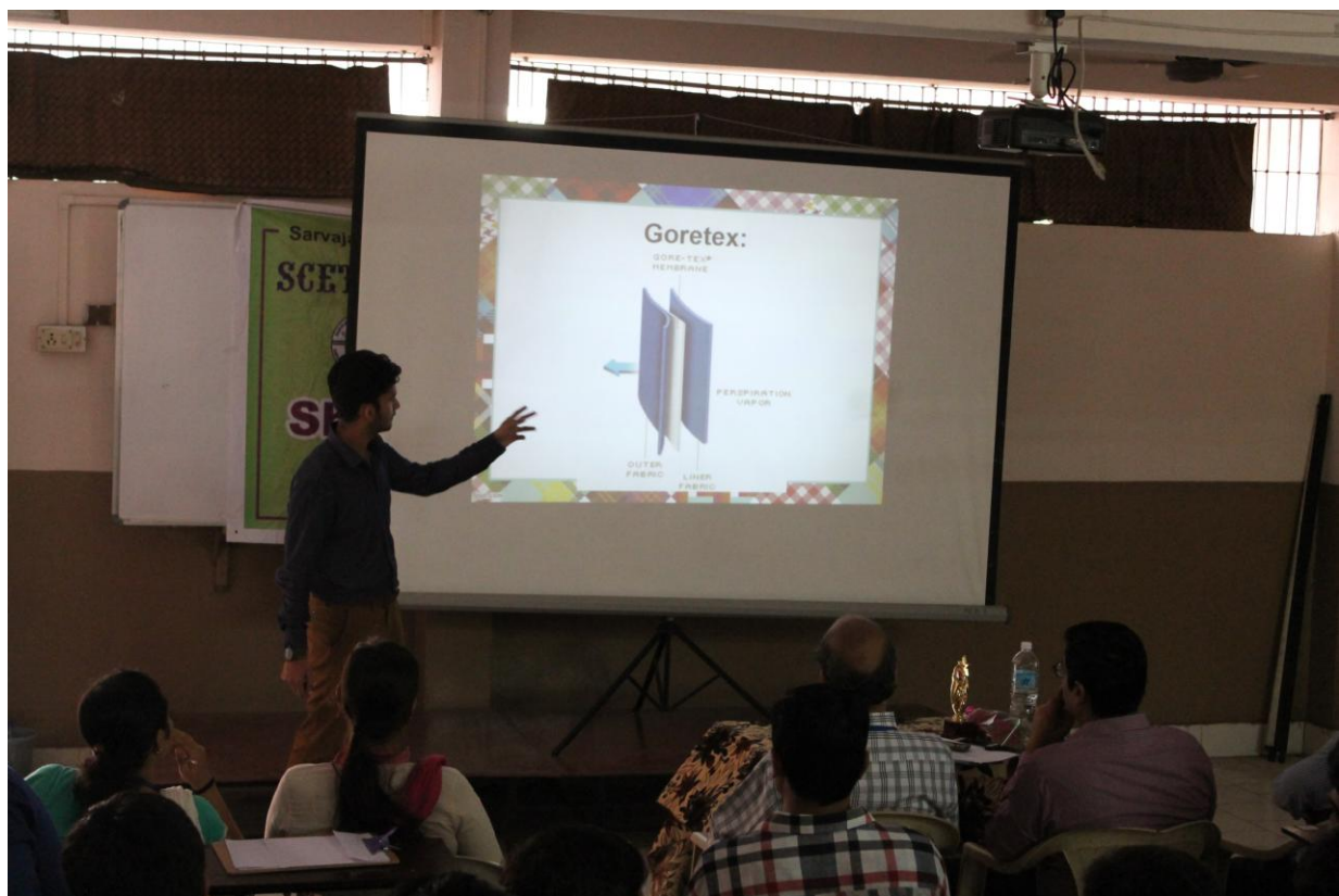
A participant presenting the paper