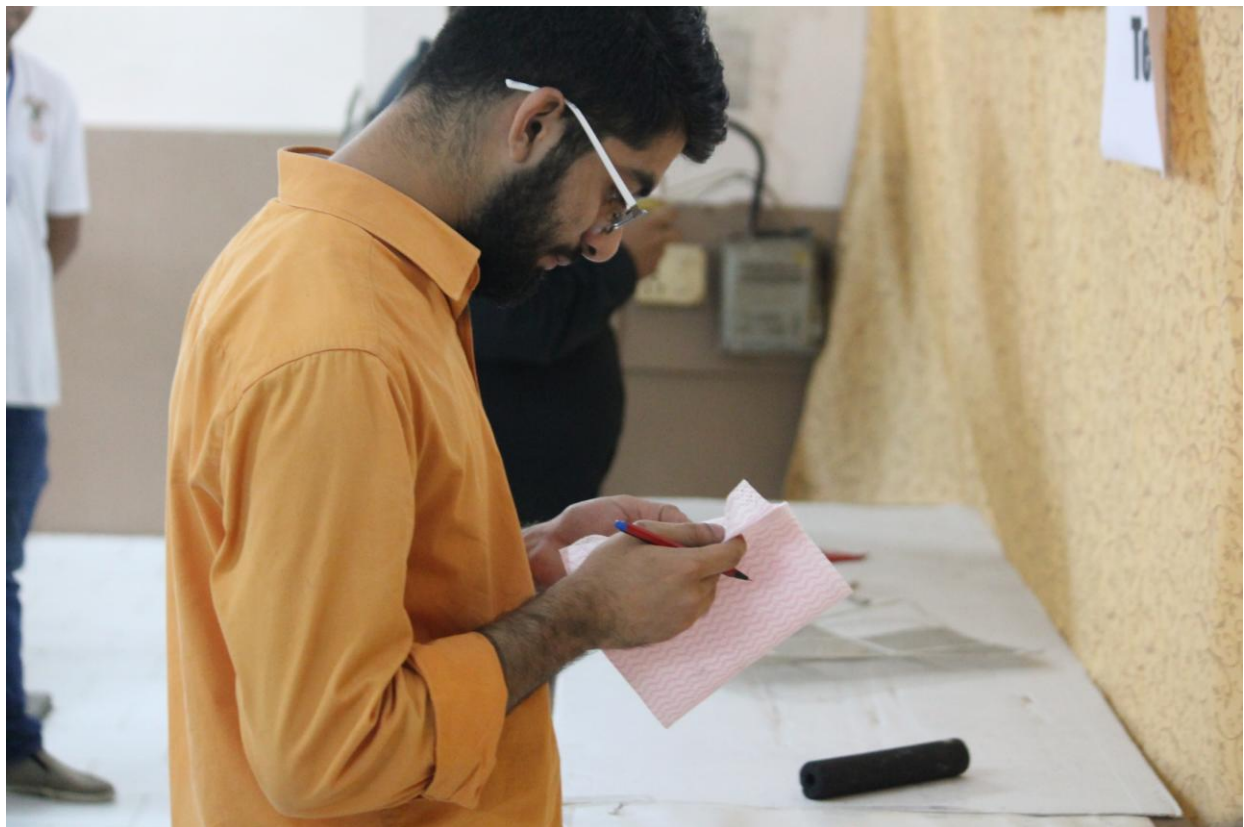
A participant observing sample in the event TexApp