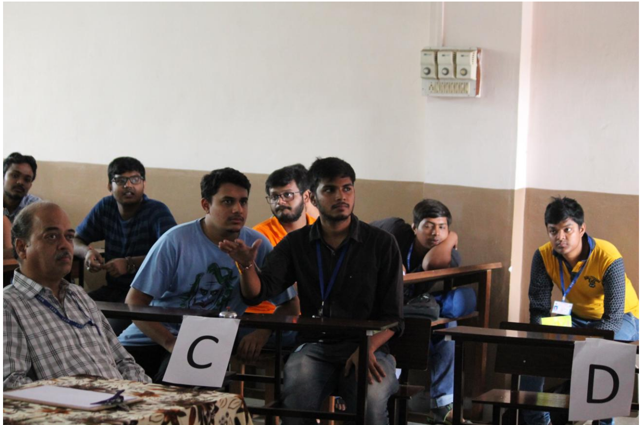
Students' team for TexQuiz event