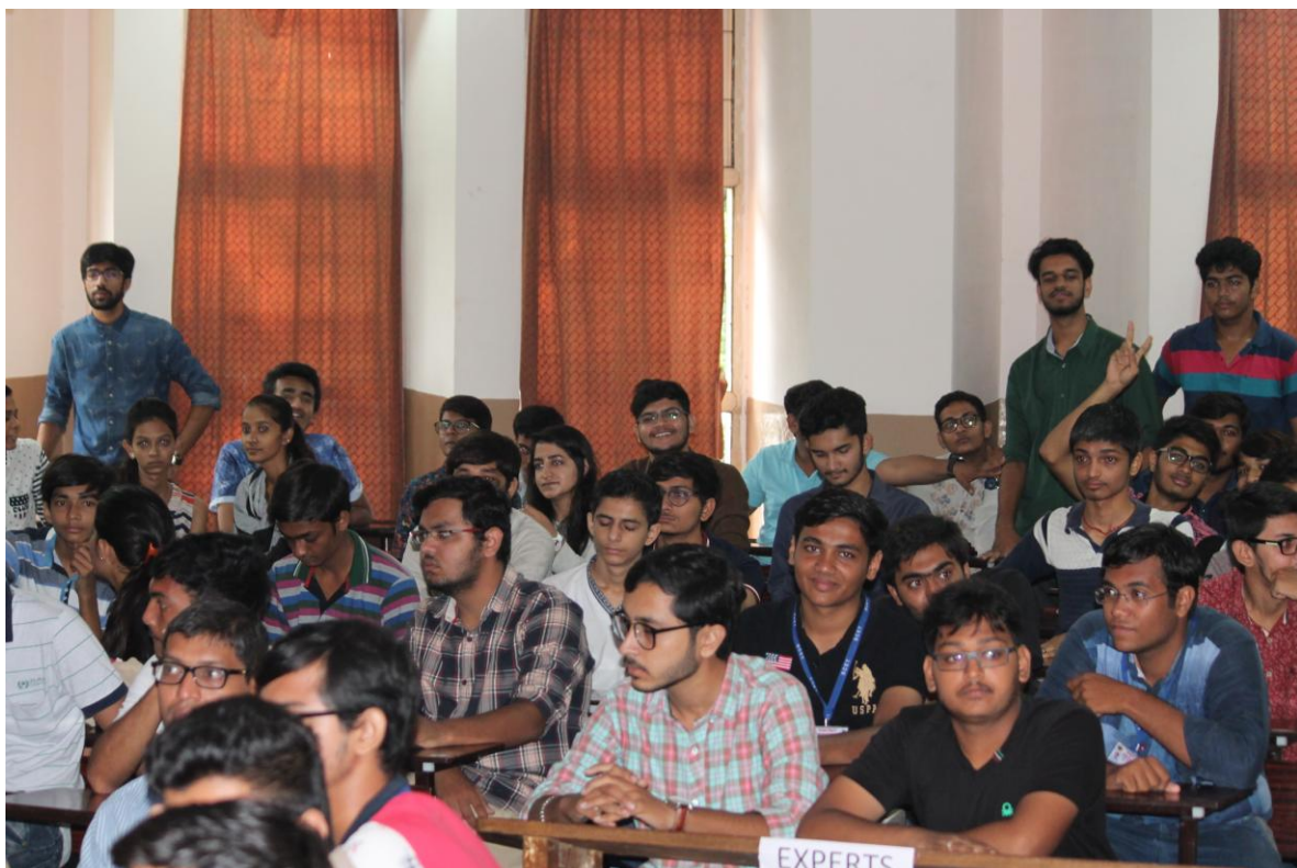
Gathering of students for event TexQuiz