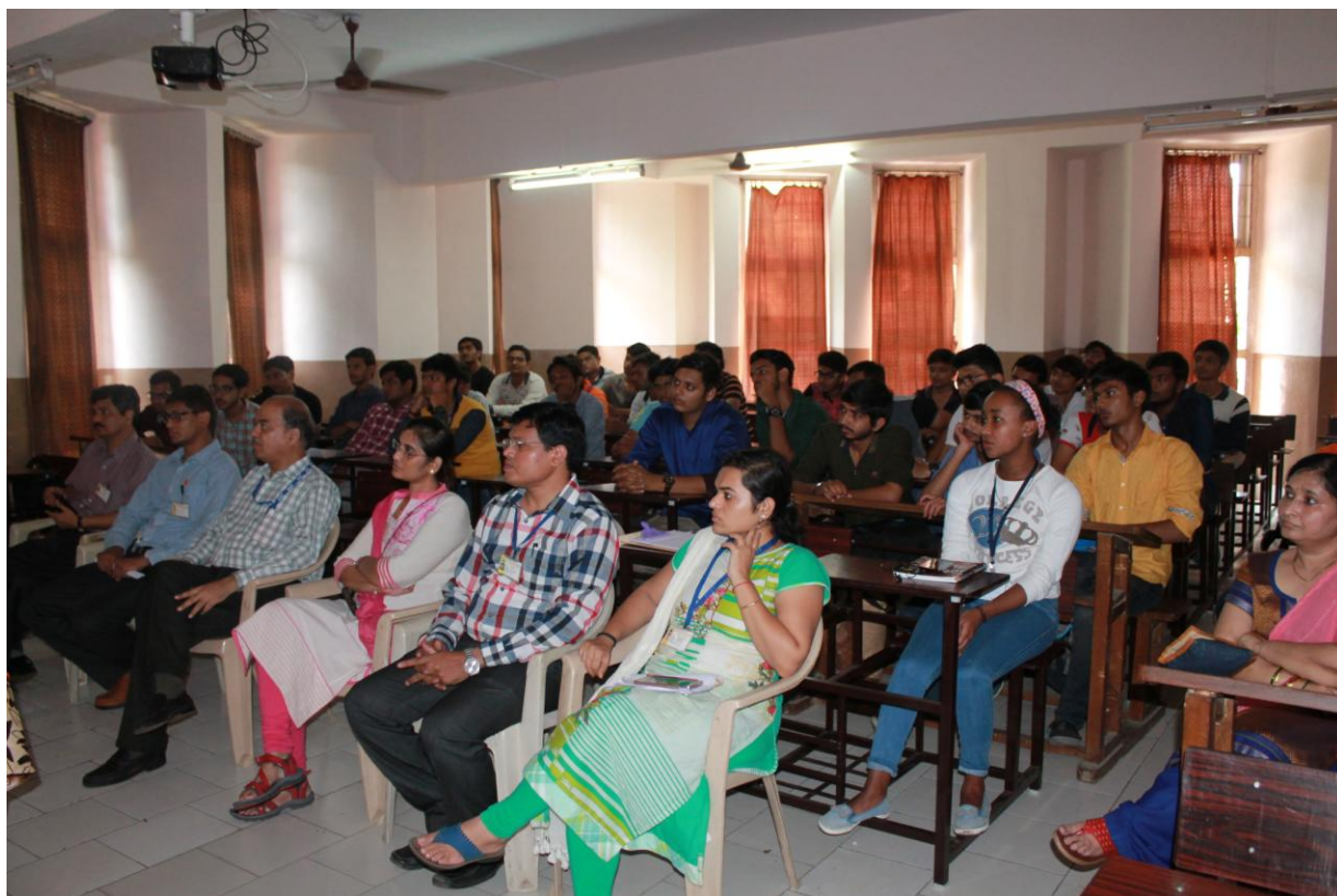
Student and Faculty gathering in Guest Lecture