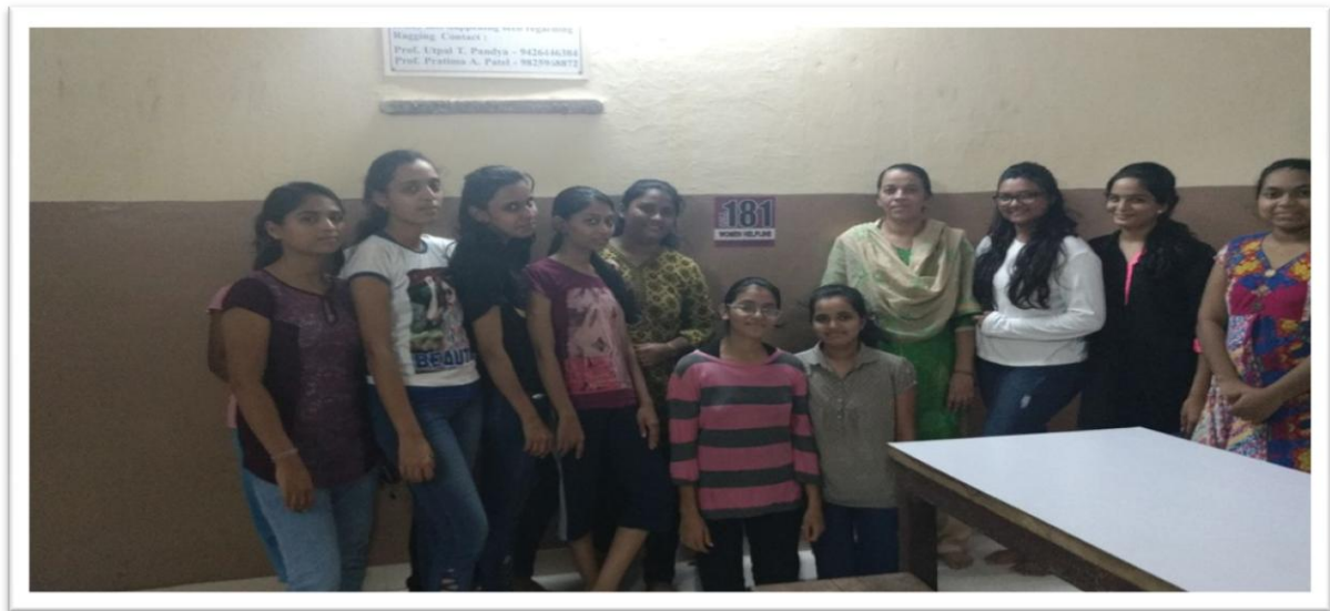
Photograph :4 NSS Volunteers on Mission "181"