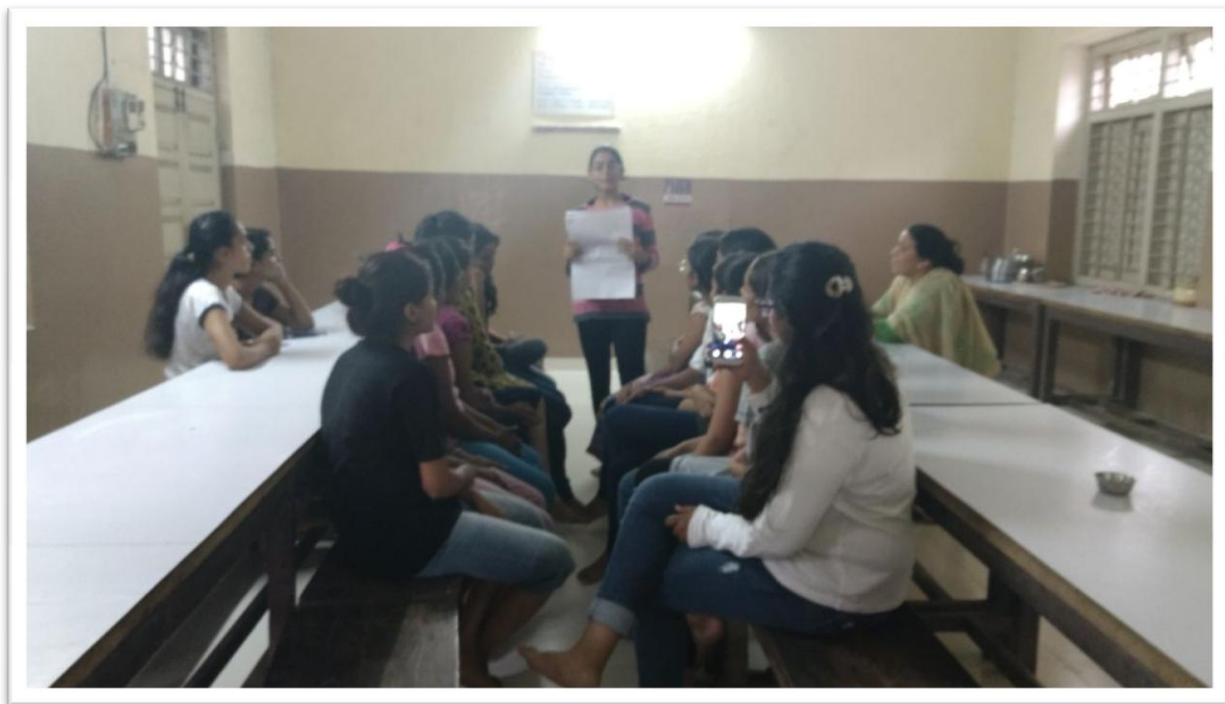
Photograph :2 NSS Volunteer explaining about Helpline Number 181