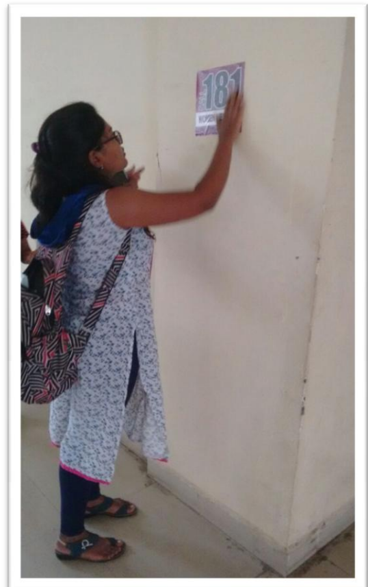
Photograph :1 NSS Volunteers sticking the posters at Girls Hostels